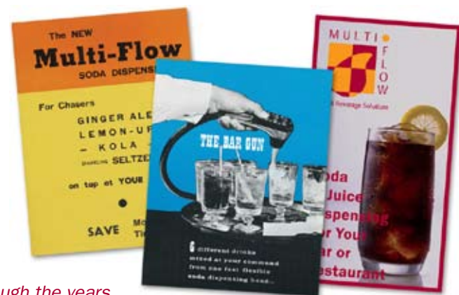
Multi-Flow through the years...